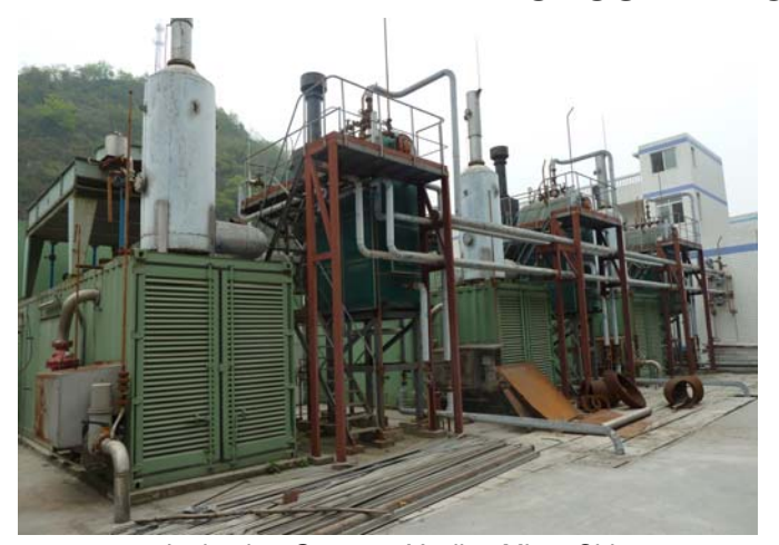
Jenbacher Gensets, Yanjing Mine, China