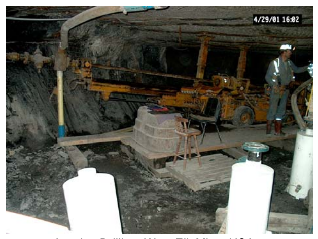
In-mine Drilling, West Elk Mine, USA