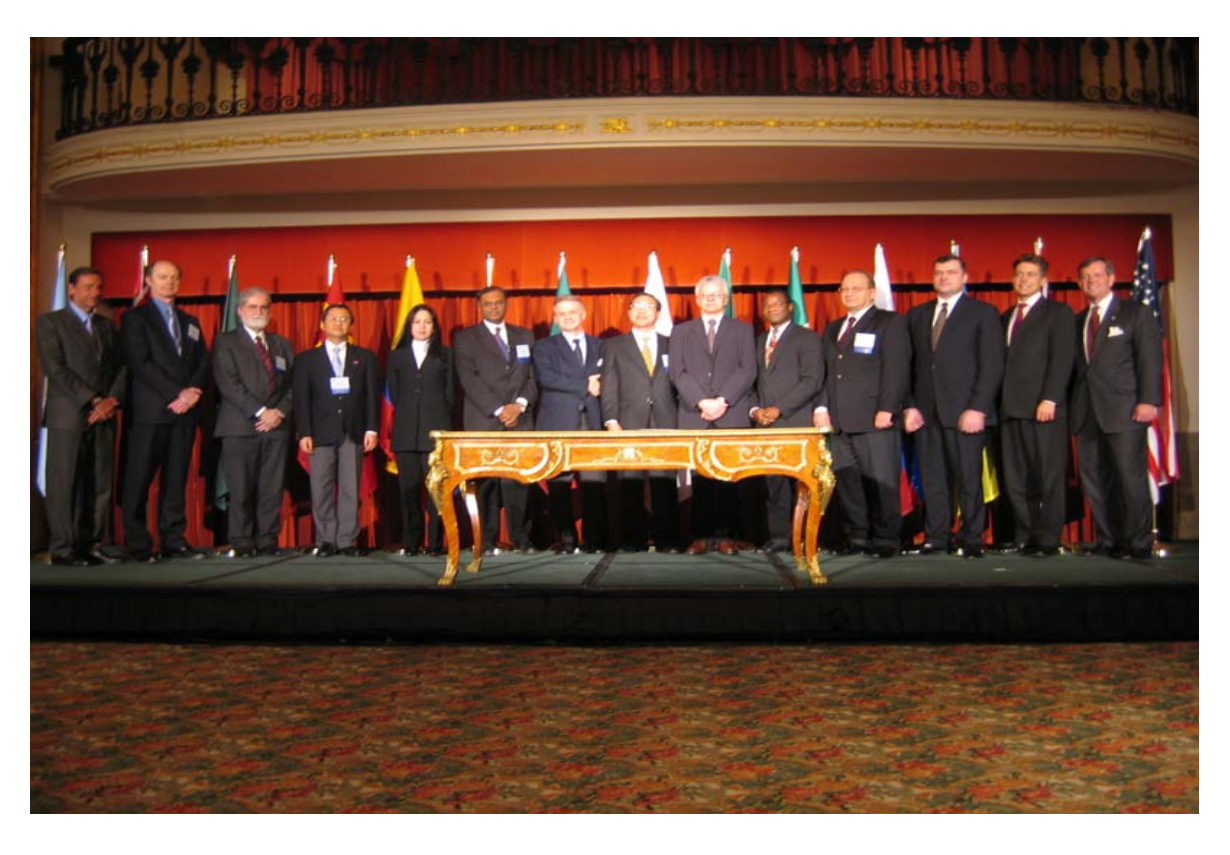
* Partners who joined after the launch