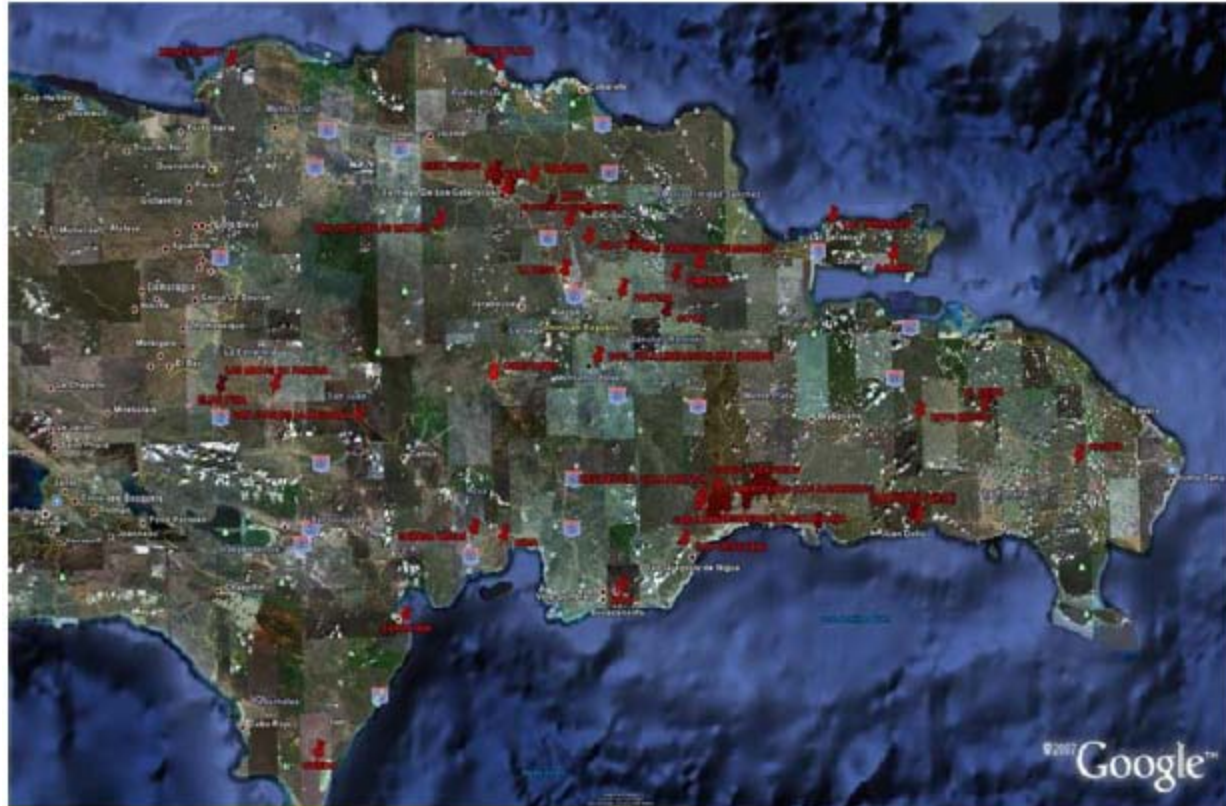
Location of WWTP inventoried