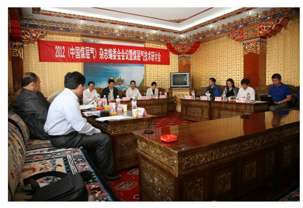
China Coadbed Methane Technology Workshop

➤On Aug 24<sup>th</sup> of 2012, the China Coadbed Methane Technology Workshop was successfully held in Sichuan Province