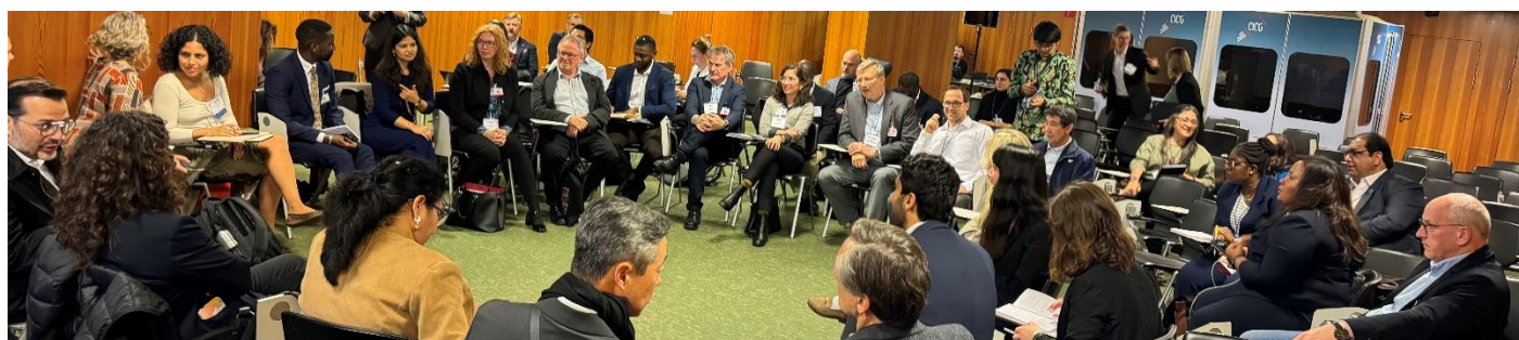
Discussion among attendees of the Biogas Joint Technical Session.

Participants connected with peers with similar roles, responsibilities, and interests. Technical experts and project developers established connections that will facilitate opportunities for new projects and foster new partnerships.