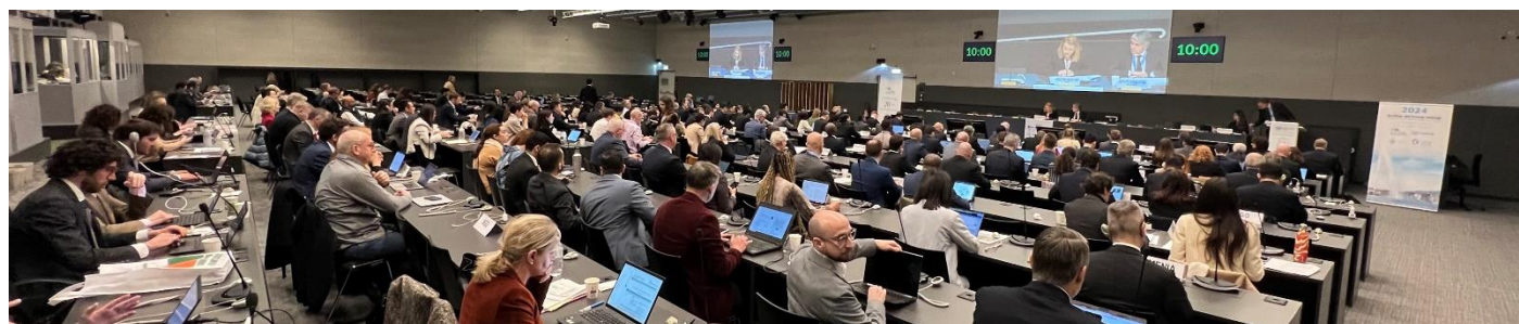
Participants during the plenary session.