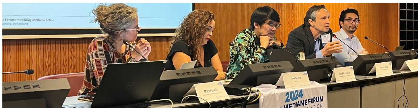
Panel discussion during a joint technical session.

Experts highlighted innovative solutions and insights for overcoming sector-specific challenges.