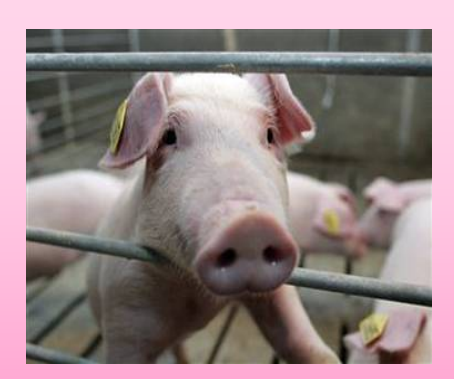
Methane Recovery and Combustion from Anaerobic Animal Manure Management Systems – PoA 5979