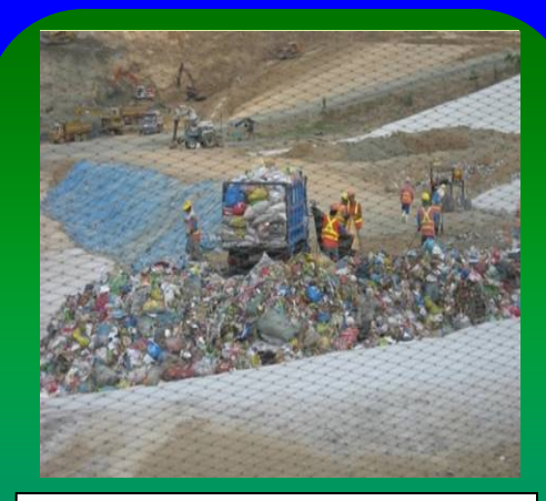
Landfill Gas Recovery and Combustion from Sanitary Landfill Sites – PoA 6707