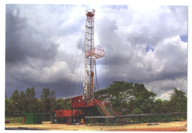
Well Drilling Rig Unit