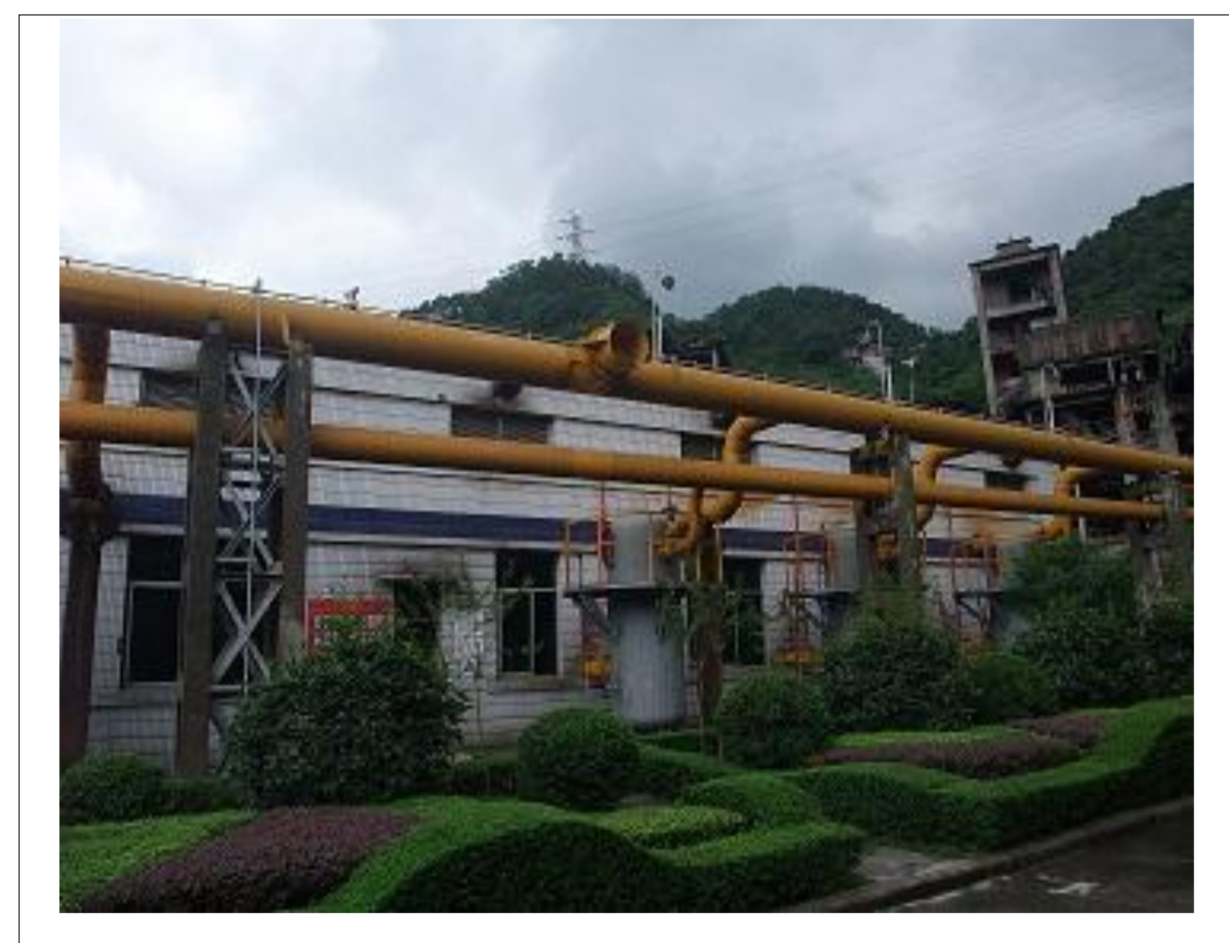
Pipelines Transporting CMM from Storage Tank to End Users