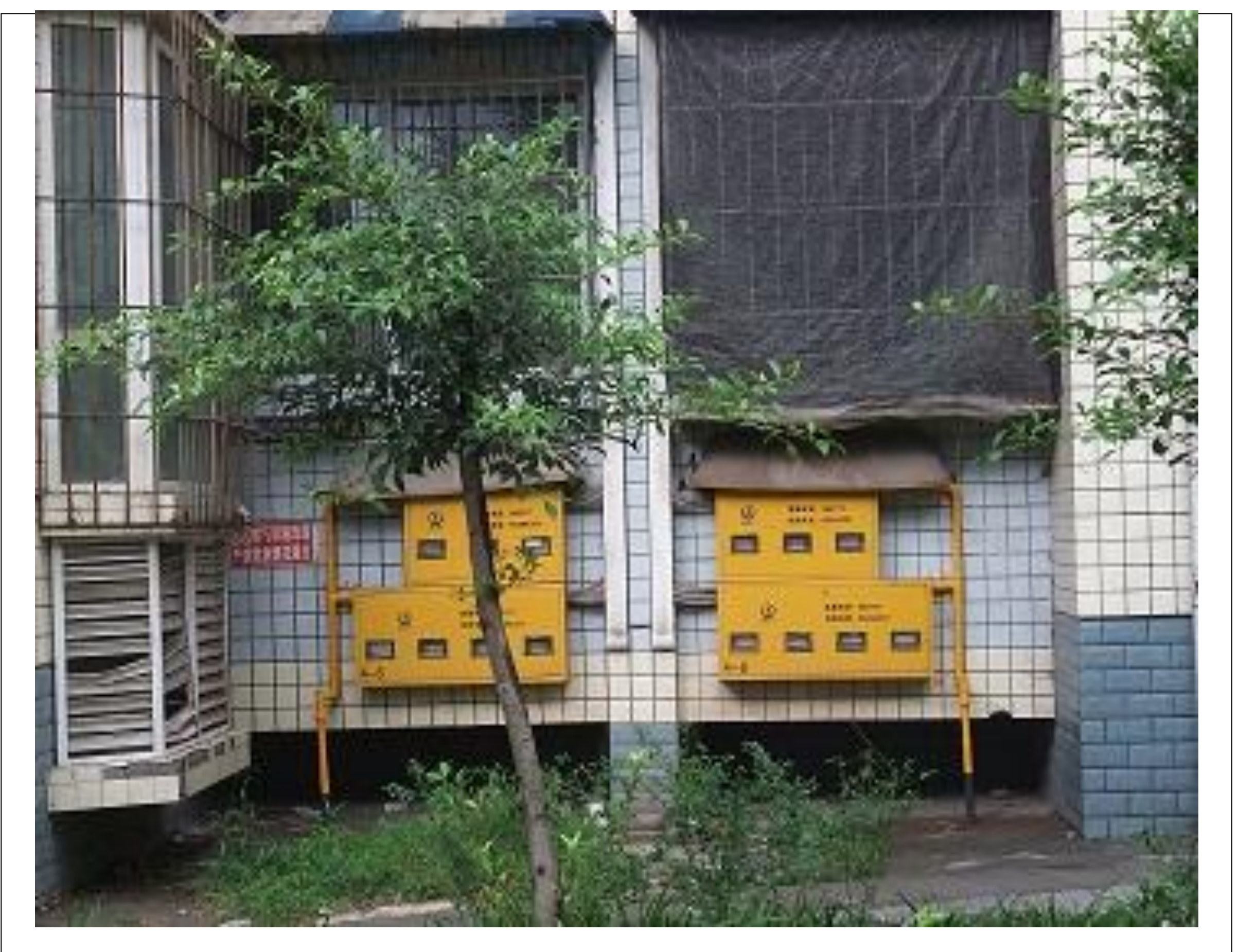
CMM Meter for Household Users